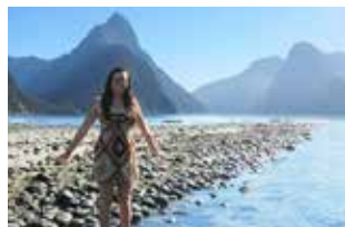
Piopiotahi Milford Sound