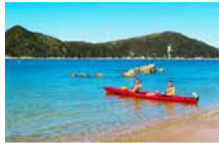
Abel Tasman/Golden Bay