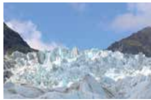
Franz Josef Glacier