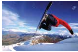
Mt Hutt ski field

Transport between cities and towns can be made by car, train, bus or plane.