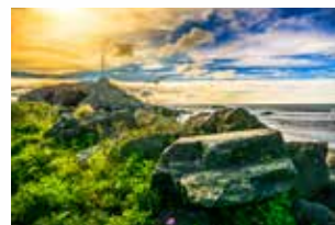
Summer beach, Christchurch