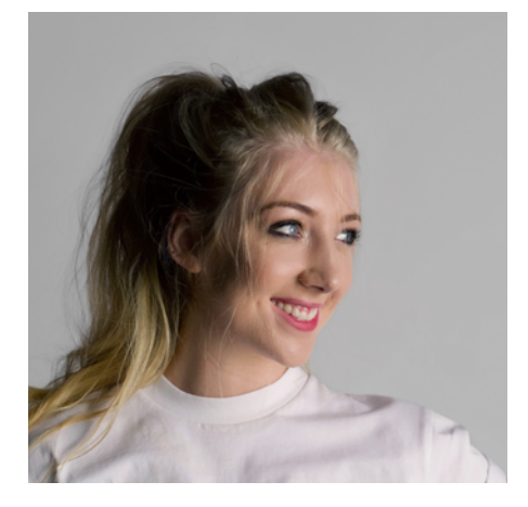
Bachelor of Engineering with Honours in Software Engineering Software Engineer at Trimble Inc.