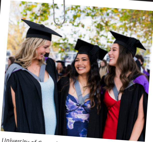
University of Canterbury April 2024